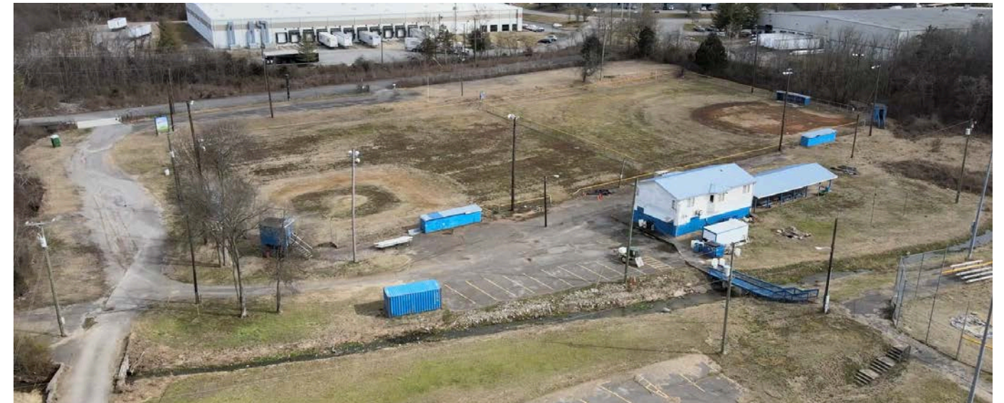
Current view of Parkwood Community ballfield, located at 3022 Aldrich Lane, Nashville