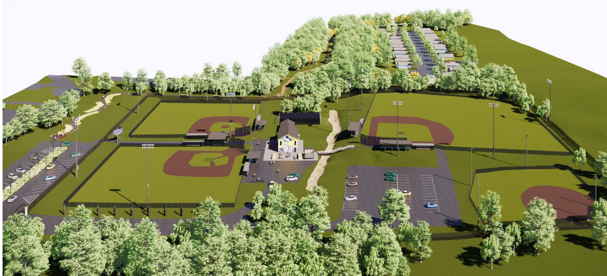
Parkwood Community Club renovation vision and park trailhead.